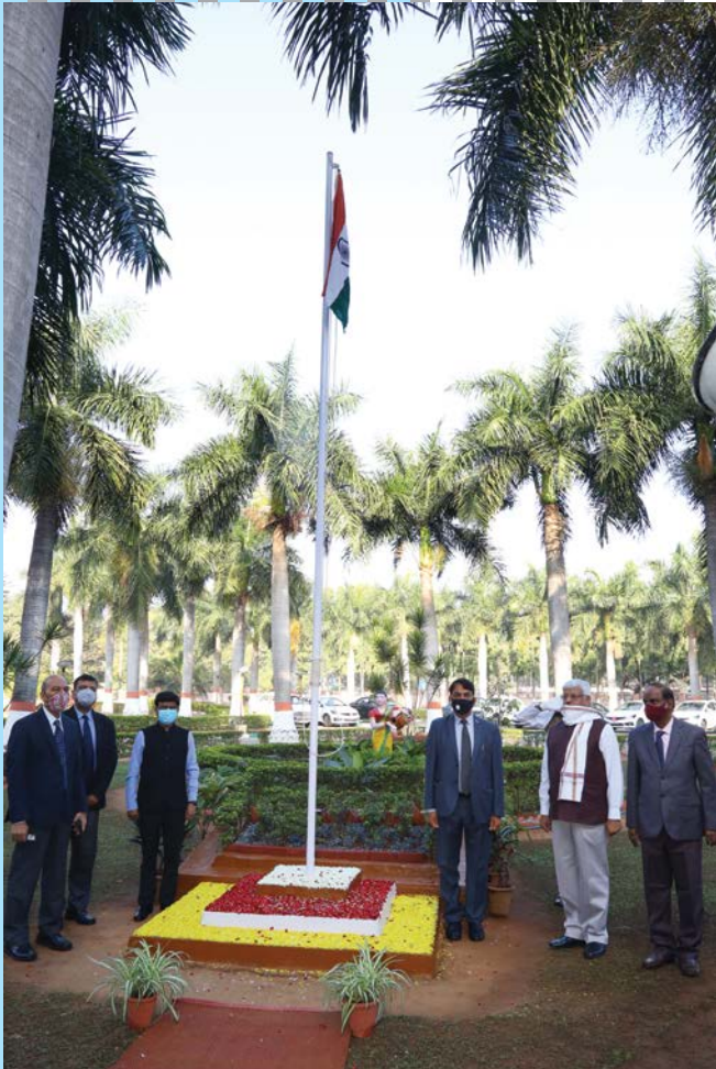
ITI Limited Celebrates 72 nd Republic Day